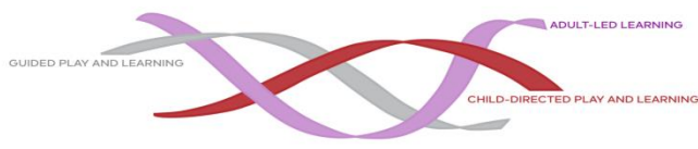
FIGURE 4: INTEGRATED TEACHING AND LEARNING APPROACHES

Our program emerges from the interests of the children through group discussion and parent contribution by sharing information about their child's interests. Educators incorporate this when developing both individual and group plans including intentional teaching moments for learning and play. We balance intentional teaching with child directed learning opportunities whilst we encourage children to seek new challenges and, in a play, based learning environment.