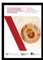
Victorian Early Years Learning and Development Framework

Approved learning framework: a guide which provides a vision for learning, pedagogical principles, practices and general goals or outcomes for children’s learning and how they might be attained. It provides a scaffold to assist educators to develop their own, more detailed curriculum relevant to their setting and the children and families attending. The Early Years Learning Framework V2 (Belonging, Being & Becoming) , the Victorian Early Years Learning and Development Framework and My Time, Our Place V2; Framework for School Age Care in Australia are approved learning frameworks for use in Victoria ( refer to Sources ).