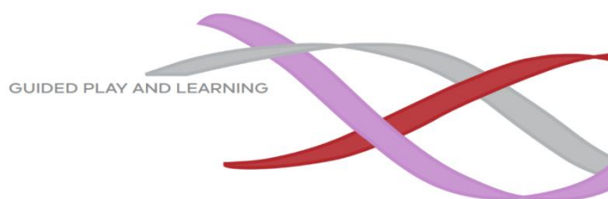
FIGURE 4: INTEGRATED TEACHING AND LEARNING APPROACHES

We are influenced by Vygotsky's Socio-Constructivist Theory, Bronfenbrenner's Ecological Theory, Erikson's Psycho-Dynamic Theory, The Reggio Emilia Educational Project, and structure curriculum with Howard Gardner's concepts of Multiple Intelligences in mind.