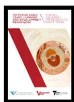
Victorian Early Years Learning and Development Framework

Approved learning framework: a guide which provides a vision for learning, pedagogical principles, practices and general goals or outcomes for children's learning and how they might be attained. It provides a scaffold to assist educators to develop their own, more detailed curriculum relevant to their setting and the children and families attending. The Early Years Learning Framework V2 (Belonging, Being & Becoming) , the Victorian Early Years Learning and Development Framework and My Time, Our Place V2; Framework for School Age Care in Australia are approved learning frameworks for use in Victoria ( refer to Sources ).