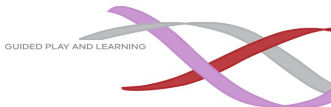
FIGURE 4: INTEGRATED TEACHING AND LEARNING APPROACHES

We are influenced by Vygotsky's Socio-Constructivist Theory, Bronfenbrenner's Ecological Theory, Erikson's Psycho-Dynamic Theory, The Reggio Emilia Educational Project, and structure curriculum with Howard Gardner's concepts of Multiple Intelligences in mind.