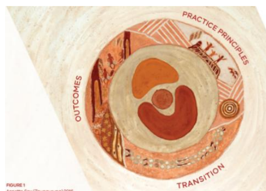
FIGURE 1 Annette Sax (Toungurung) 2016

The National Quality Standard (NQS) sets a high national benchmark for centres like Yongala Preschool.